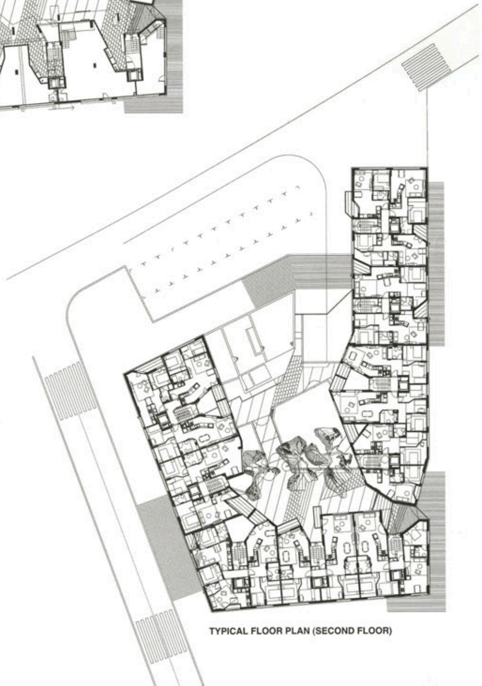
TYPICAL FLOOR PLAN (SECOND FLOOR)